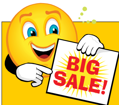
TABLE TOP SALE YARMOUTH TOWN HALL